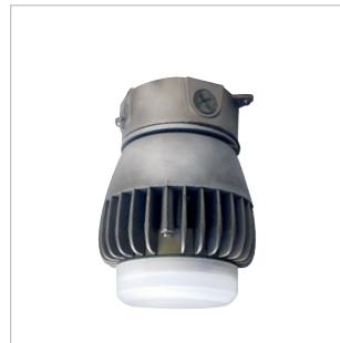
DVAKS2-LED Ceiling mount