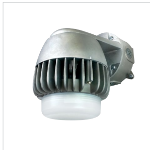
DVBSK2-LED Wall mount