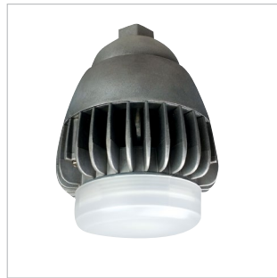
DVCS2-LED Pendant mount