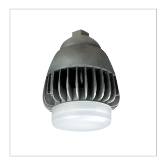
DVCS2-LED Pendant mount