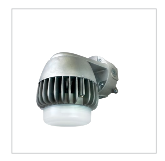
DVBKS2-LED Wall mount